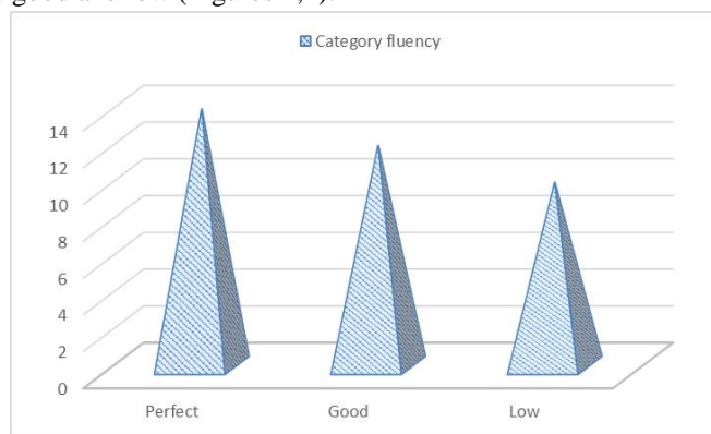
Figure 1: Performance of participants on category fluency task.

The performance on category fluency and phonemic fluency tasks was analysed with respect to the rating on speaking domain of LEAP Q. Participants who rated ‘good’ proficiency obtained a mean score of 12 on category fluency and 10 on phoneme fluency task as a whole. Participants who rated their proficiency to be ‘perfect’ proficiency obtained a mean score of 14 and 13 on category and phonemic fluency respectively. The 8 Participants who rated their proficiency to be ‘low’ obtained a mean score of 10 and 8 on category and phoneme fluency tasks The mean scores on both category fluency as well as phoneme fluency task was more for participants who had rated their second language proficiency to be perfect followed by participants who had rated their proficiency as good and low (Figures 1,2).